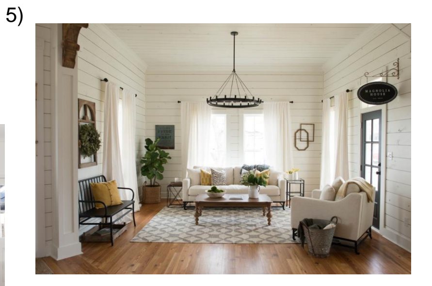
Joanna Gaines <u>MagnoliaMarket.com</u>